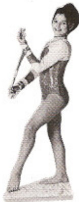
Statues 10" - $45