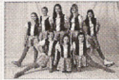
8x10 Digital Memory Mat $18 Small Group and Individual