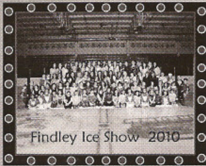
8x10 Large Team Mat $13 Includes year and Team Name