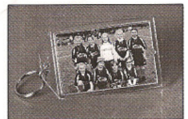
2-Rectangle Keychains $10

Add-Ons Available with any other Purchase