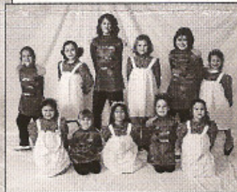
Small Group 5x7 - $10