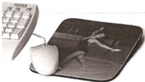
Personalized Photo Mouse Pad $25

**** Please mark envelope if pose is needed for program ****