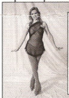
Individual 5x7 - $10 8x10 - $12